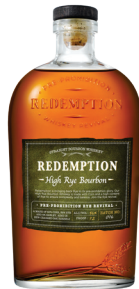
High Rye Bourbon