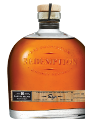
10 Years Aged Rye