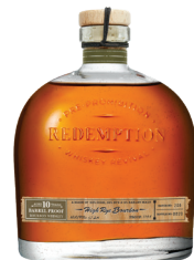
10 Years Aged High Rye Bourbon