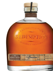
9 Years Aged Bourbon