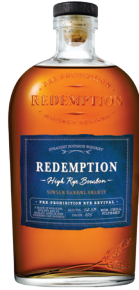
Single Barrel Select High Rye Bourbon