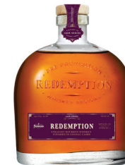
Redemption Cognac Finish