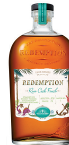
Rum Cask Finish Rye