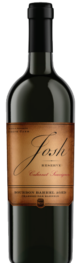
Bourbon Barrel Aged Cabernet Sauvignon California