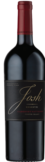
Cabernet Sauvignon North Coast