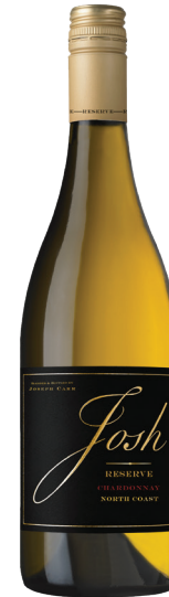
Chardonnay North Coast