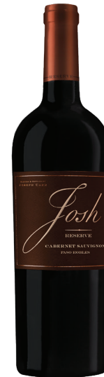
Cabernet Sauvignon Paso Robles