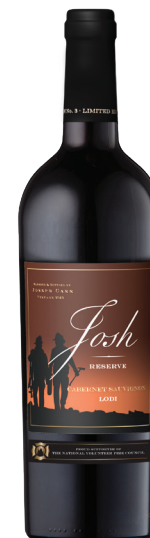
Limited Edition Cabernet Sauvignon Lodi