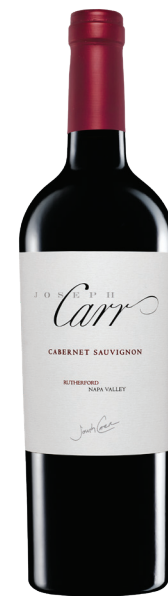
Cabernet Sauvignon Rutherford