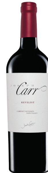
Cabernet Sauvignon Revelist Napa Valley