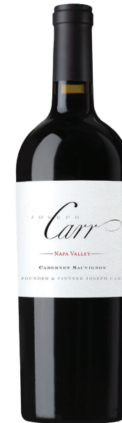
Cabernet Sauvignon Napa Valley